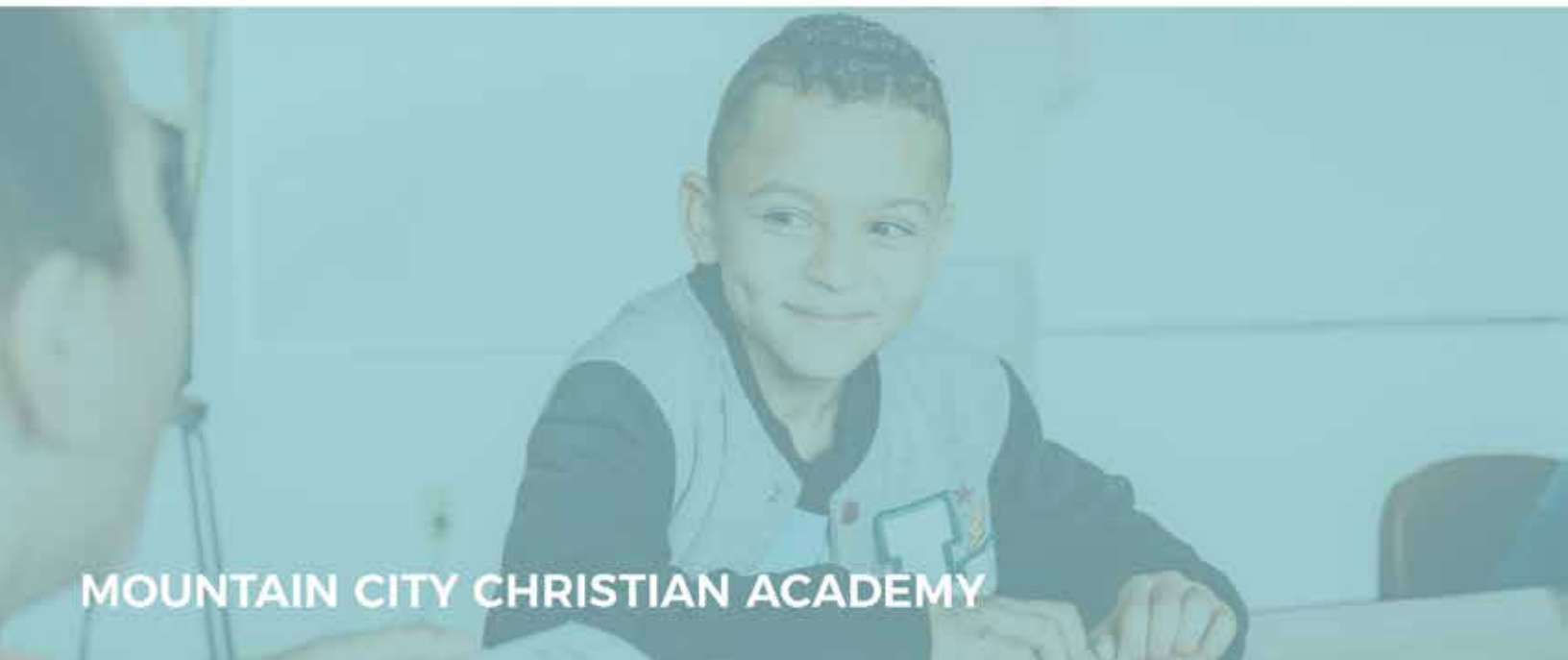
MOUNTAIN CITY CHRISTIAN ACADEMY