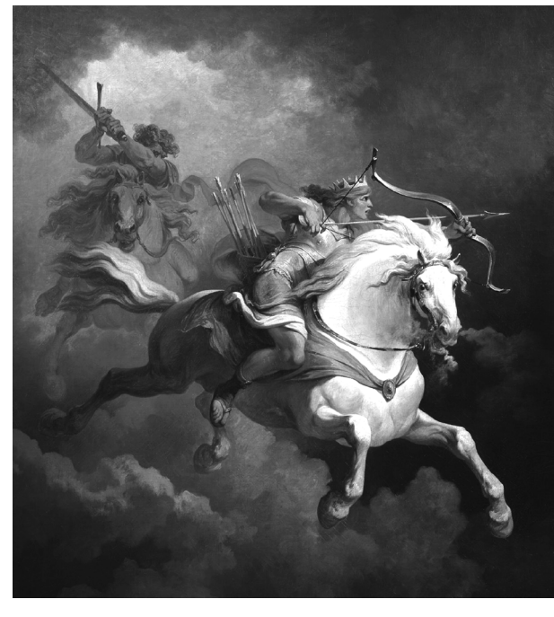
The Vision of the White Horse 1798 Philip James De Loutherbourg

And the angel said to me, "Write this: Blessed are those who are invited to the marriage supper of the Lamb." And he said to me, "These are the true words of God." Then I fell down at his feet to worship him, but he said to me, "You must not do that! I am a fellow servant with you and your brothers who hold to the testimony of Jesus. Worship God." For the testimony of Jesus is the spirit of prophecy.