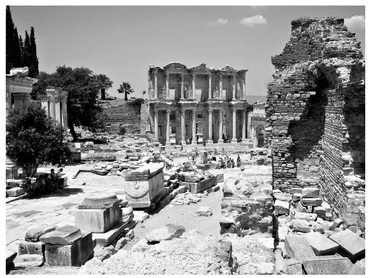
Ruins of the Church in Ephesus: Selçuk, İzmir Province, Turkey