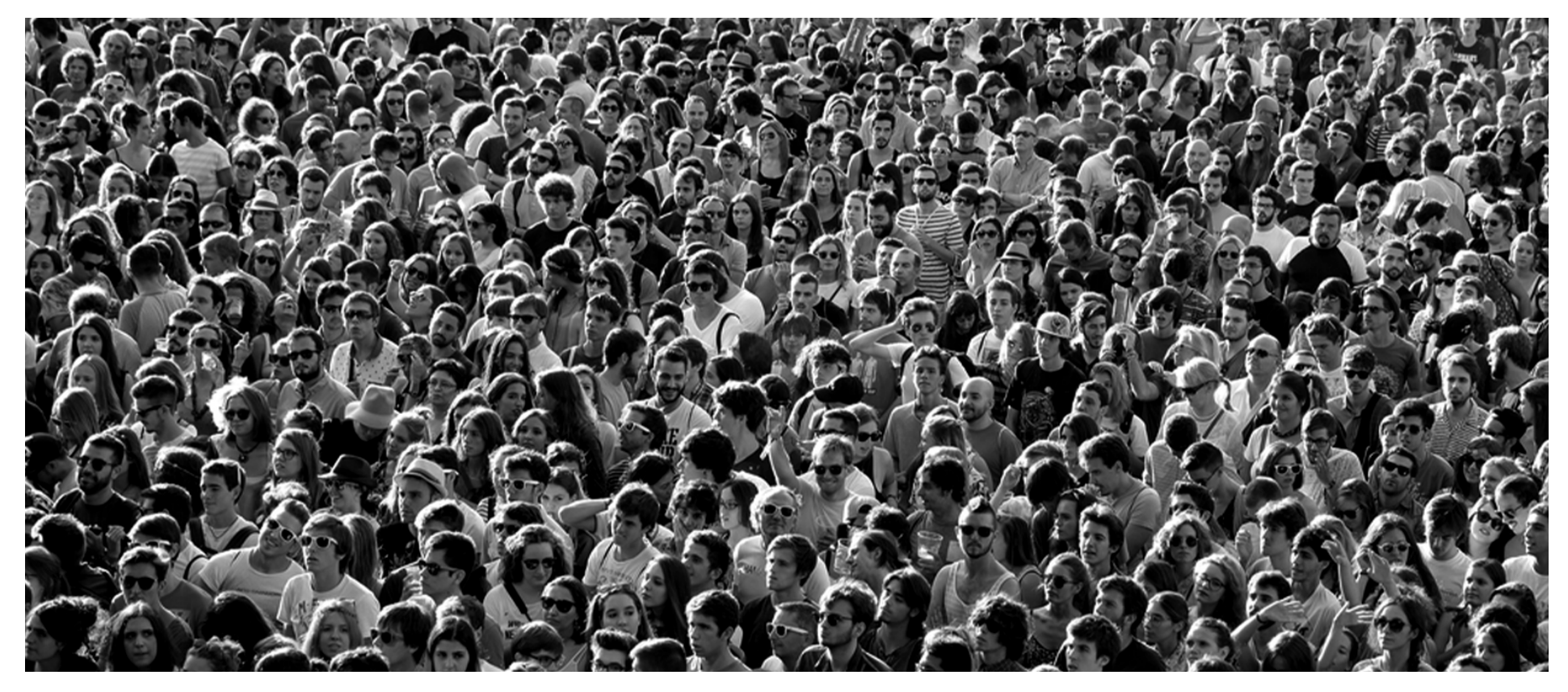
A Great Multitude