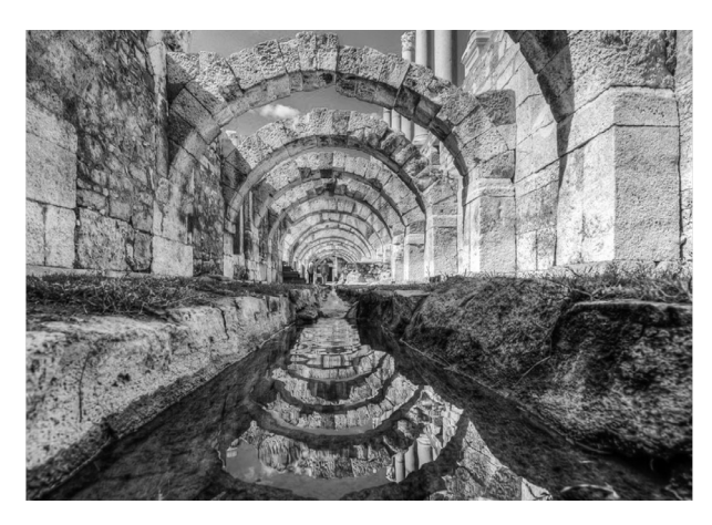
Church in Smyrna: İzmir Province, Turkey

When I saw him, I fell at his feet as though dead. But he laid his right hand on me, saying, "Fear not, I am the first and the last, and the living one. I died, and behold I am alive forevermore, and I have the keys of Death and Hades. Write therefore the things that you have seen, those that are and those that are to take place after this. As for the mystery of the seven stars that you saw in my right hand, and the seven golden lampstands, the seven stars are the angels of the seven churches, and the seven lampstands are the seven churches.