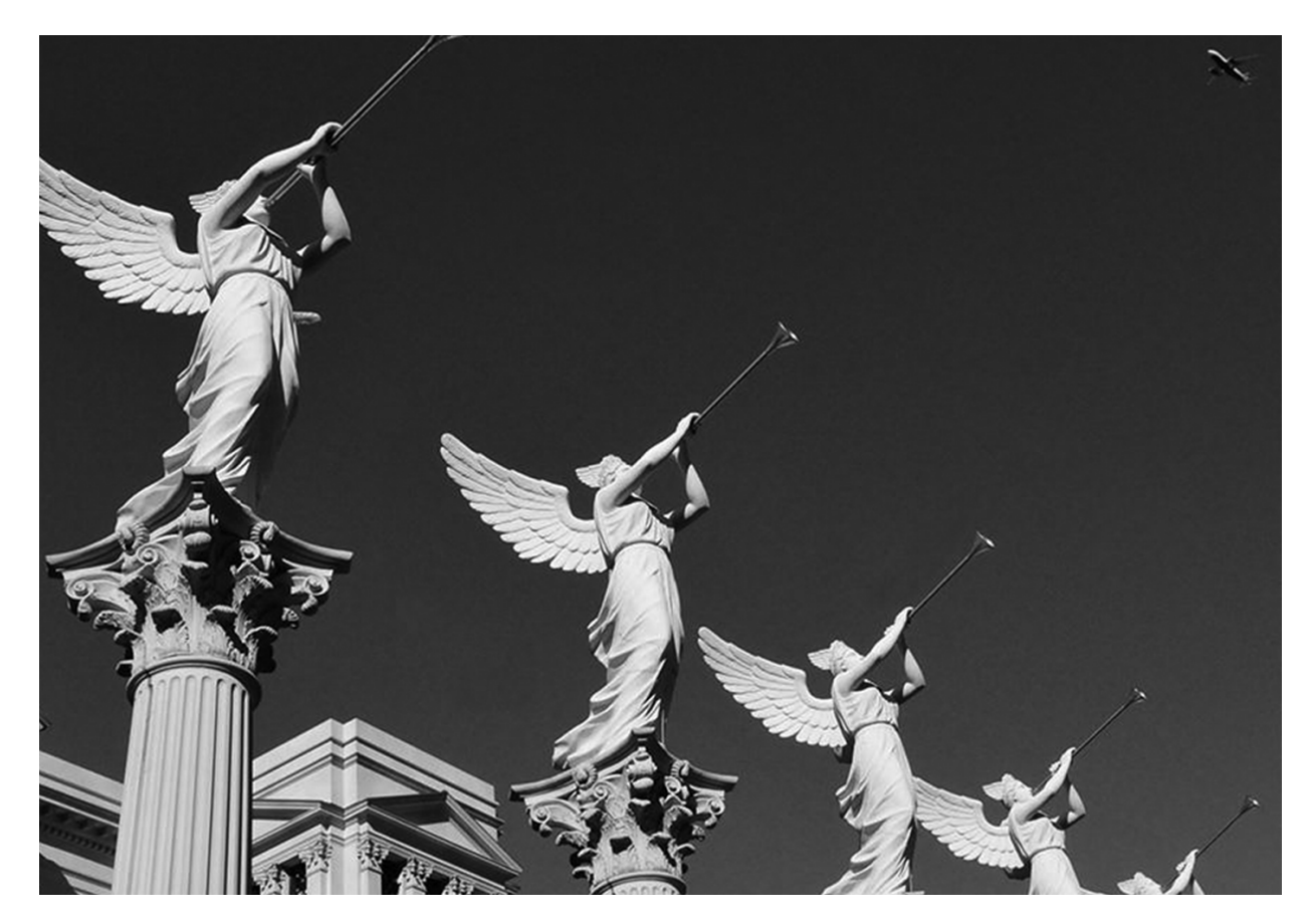
Statues of Angels Blowing Trumpets: Caesars Palace in Las Vegas