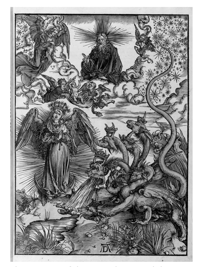
The Woman of the Apocalypse and the Seven-headed Dragon; Albrecht Dürer

And a great sign appeared in heaven: a woman clothed with the sun, with the moon under her feet, and on her head a crown of twelve stars. She was pregnant and was crying out in birth pains and the agony of giving birth. And another sign appeared in heaven: behold, a great red dragon, with seven heads and ten horns, and on his heads seven diadems. His tail swept down a third of the stars of heaven and cast them to the earth. And the dragon stood before the woman who was about to give birth, so that when she bore her child he might devour it. She gave birth to a male child, one who is to rule all the nations with a rod of iron, but her child was caught up to God and to his throne, and the woman fled into the wilderness, where she has a place prepared by God, in which she is to be nourished for 1,260 days.