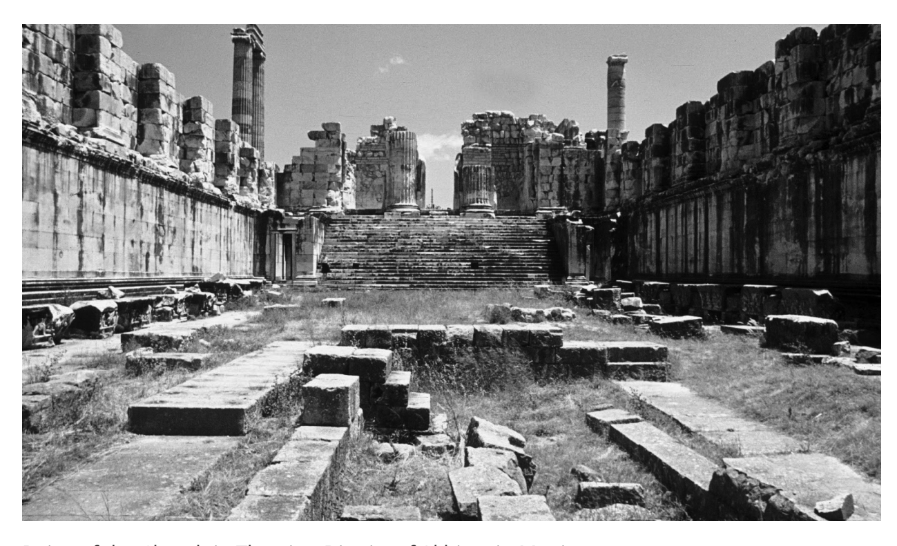
Ruins of the Church in Thyatira: District of Akhisar in Manisa