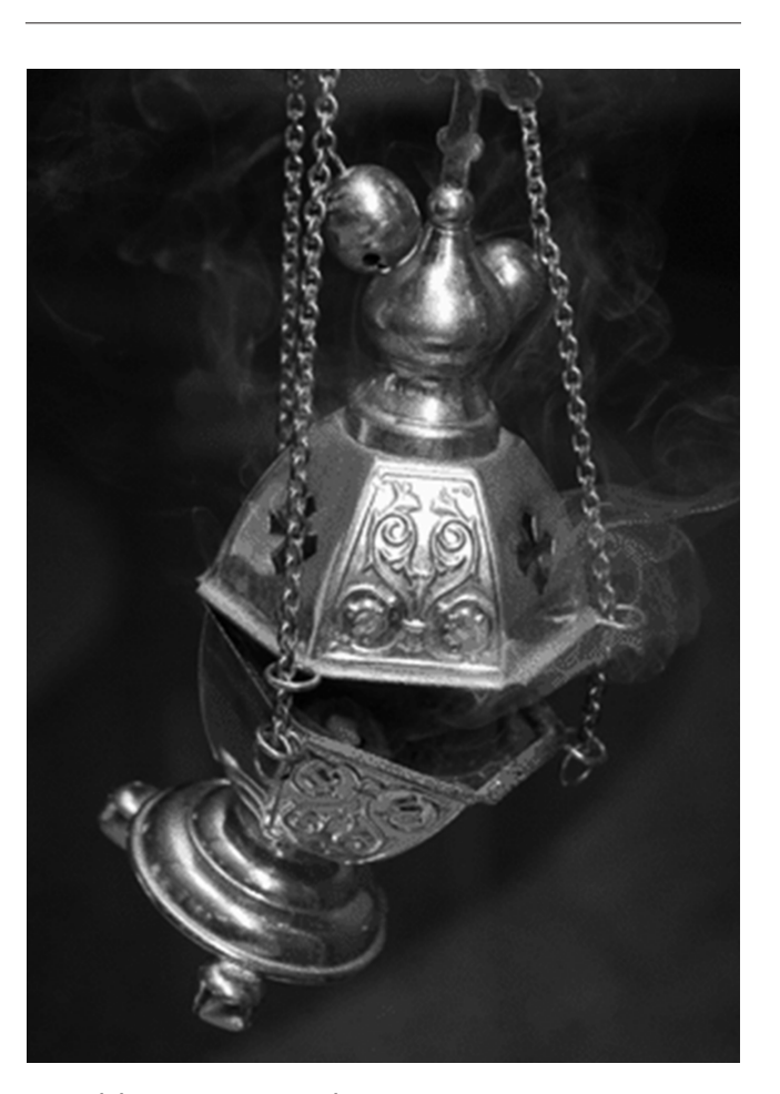
A Golden Censer with Burning Incense

When the Lamb opened the seventh seal, there was silence in heaven for about half an hour. Then I saw the seven angels who stand before God, and seven trumpets were given to them. And another angel came and stood at the altar with a golden censer, and he was given much incense to offer with the prayers of all the saints on the golden altar before the throne, and the smoke of the incense, with the prayers of the saints, rose before God from the hand of the angel. Then the angel took the censer and filled it with fire from the altar and threw it on the earth, and there were peals of thunder, rumblings, flashes of lightning, and an earthquake.