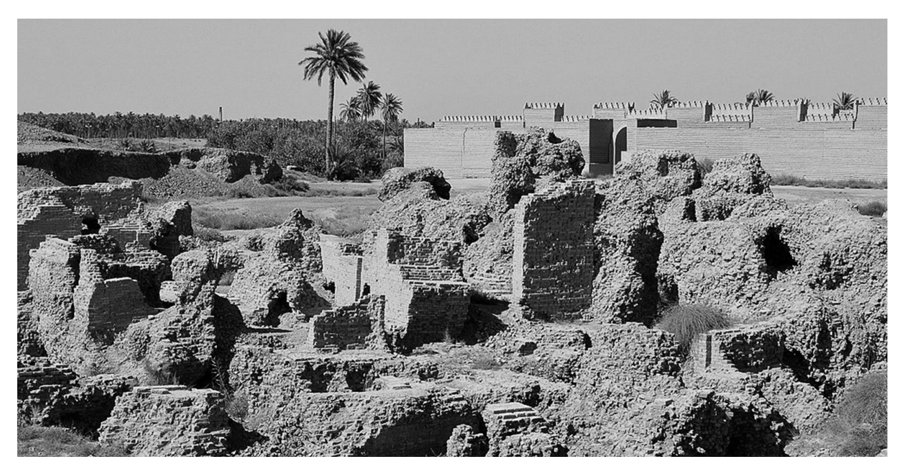
Ruins of Babylon: Mesopotamia, Iraq