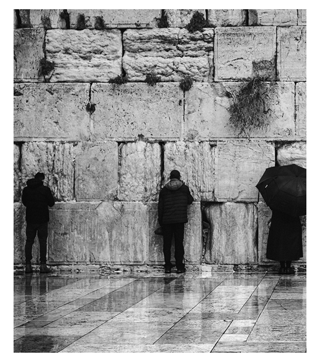
Prayers for Peace at Western Wall: Israel

Then I saw another sign in heaven, great and amazing, seven angels with seven plagues, which are the last, for with them the wrath of God is finished.