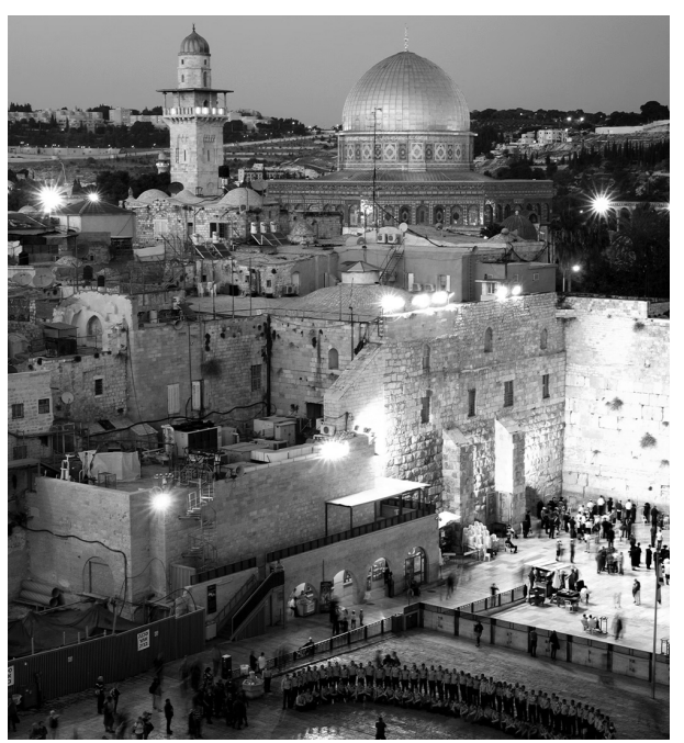
Dome of the Rock Western Wall: lerusalem, Israel

Then came one of the seven angels who had the seven bowls full of the seven last plagues and spoke to me, saying, "Come, I will show you the Bride, the wife of the Lamb." And he carried me away in the Spirit to a great, high mountain, and showed me the holy city Jerusalem coming down out of heaven from God, having the glory of God, its radiance like a most rare jewel, like a jasper, clear as crystal. It had a great, high wall, with twelve gates, and at the gates twelve angels, and on the gates the names of the twelve tribes of the sons of Israel were inscribed— on the east three gates, on the north three gates, on the south three gates, and on the west three gates. And the wall of the city had twelve foundations, and on them were the twelve names of the twelve apostles of the Lamb.