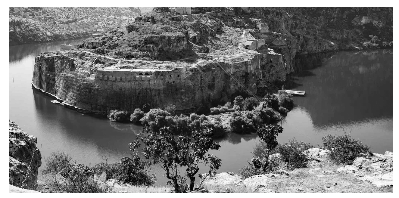
Euphrates River

And he who was seated on the throne said, "Behold, I am making all things new." Also he said, "Write this down, for these words are trustworthy and true." And he said to me, "It is done! I am the Alpha and the Omega, the beginning and the end. To the thirsty I will give from the spring of the water of life without payment. The one who conquers will have this heritage, and I will be his God and he will be my son. But as for the cowardly, the faithless, the detestable, as for murderers, the sexually immoral, sorcerers, idolaters, and all liars, their portion will be in the lake that burns with fire and sulfur, which is the second death."